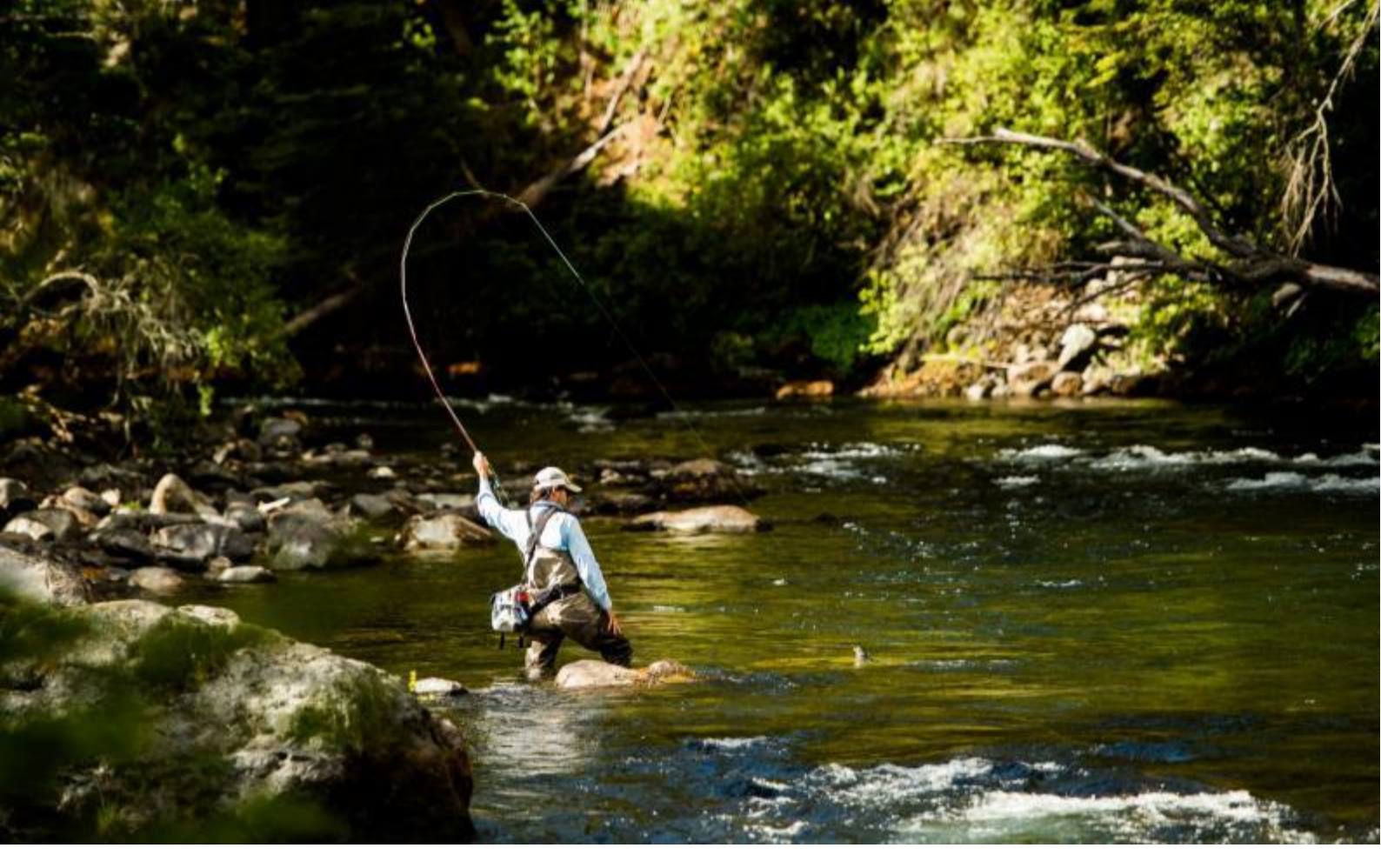
DAY 2 Sunday: Alumine River Float Trip - Evening Tango Dancing Show at the Lodge

The Alumine River is a large size stream that runs from north to south in a deep canyon in the foothills of the Andes. Today we will float on an eight miles section of the river looking for rainbow and brown trout that range from 18 to 20 inches. There will be suitable water to drift slowly as we sight cast to rising trout. We'll also have the opportunity to cover the riffles with hopper and droppers, which can be very effective. For those who are enthusiastic about streamer fishing there will be the chance to tempt some of the large brown trout that live along the banks.